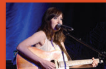
Musical Guest Francesca Battistelli