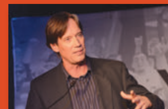
Keynote Kevin Sorbo